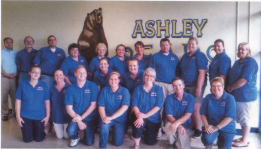
*Dedicated* The school staff shows their unity with their staff shirts. They are trying to look their best for the new school year.